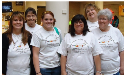
Staff of New Generation Christian Learning Center of Augusta.